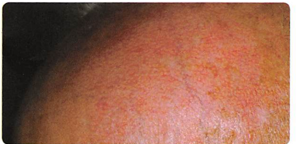
1 year after treatment